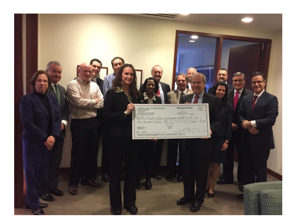
What is The Lawyers' Club of Philadelphia?

"The Lawyers' Club provided an invaluable opportunity to become acquainted with a cross-section of practitioners, and the leaders of the bench and bar, in a collegial setting; and remains an unequaled value." - Judge D. Webster Keogh